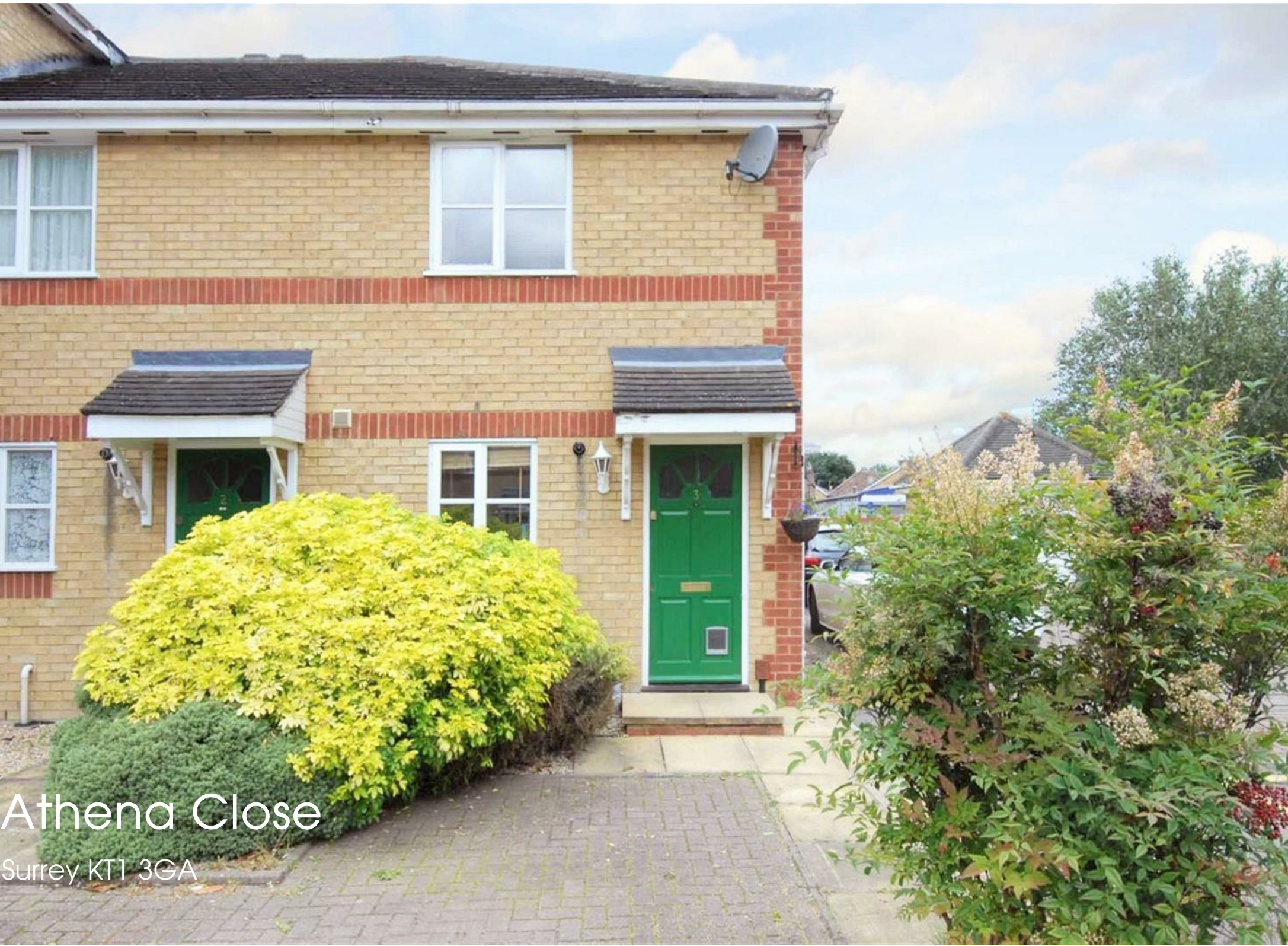
Athena Close Surrey KT1 3GA